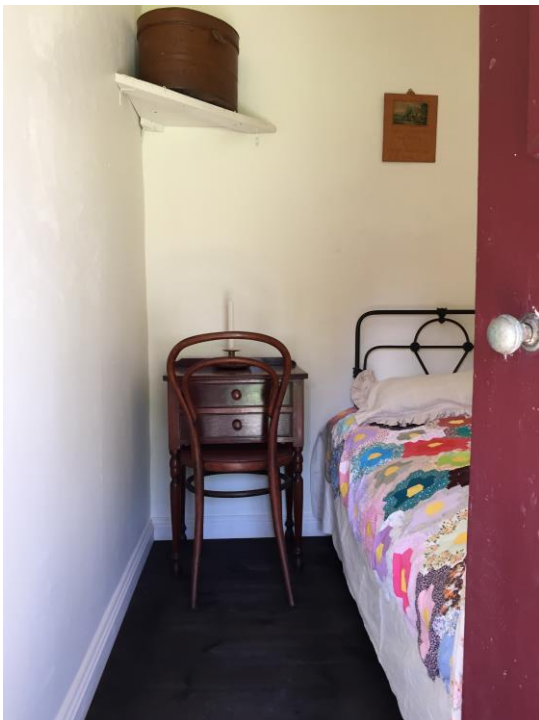
Servant's Room – chased, rendered, timber floor laid and walls painted.

The last six months have been extremely busy for the Trust. We have convened three Strategic Planning Sessions, completed our Self Review for the History Trust of South Australia's new program Museums and Collections and ventured on a program of building maintenance. The lichen has been removed from most of the slate tiled roof, broken tiles have been replaced, the servant's quarters were restored, repairs were made to the western window, three verandahs, including the replacement of the pole supports plus various other small anomalies in the building fabric. The drapery has been dry cleaned after many years of neglect. Three new tool sheds have been erected and paved and we have purchased a white marquee and 45 new white chairs, funded by GrantsSA . The City of Charles Sturt has again supported our Heritage Garden Project with a grant of $4,400. Our next project is to replace the wall paper in the dining room which has been deteriorating over the last 20 years and to repaint all the front shutters and fascia. We are hopeful of receiving a Heritage SA grant later in the year to implement the project.