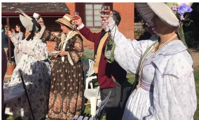
The toast to Captain Sturt