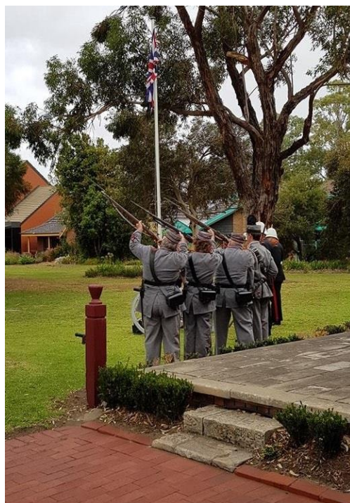
Adelaide Rifles 1862 Fort Glanville Historical Association